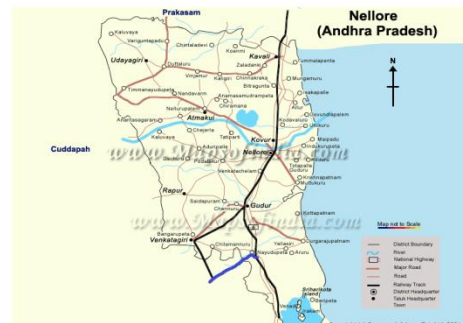
Figure:1: Nellore district road map

NH71 is a Highway passing in the Nellore and Chittoor districts runs between Madanapalle and Naidupeta, having a complete length of 191 km, in which 43.8 km length of stretch from Naidupeta to Yerpedu the analysis of crashes is done. In which 19.3 km covered in Nellore and 24.5 km in Chittoor districts, all with 2 lane bitumen surface. Layout of NH 71 is shown in the below figures