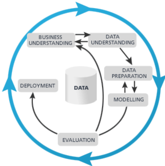
Figure: 1 Data Mining Process