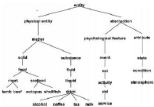
Fig. 2: - A fragment of WordNet concept taxonomy.

musings are semantically equivalent the use of records drawn from thought logical arrangement or IC. Estimations take as information a couple of benchmarks, and retreat a numerical cost demonstrating their semantic comparability. Various applications depend upon this comparability rating to rank the resemblance among interesting arrangements of principles. Partake in WordNet thought logical classification in Fig. 2 as delineation, given the idea sets of (red meat; sheep) and (ground sirloin sandwich; octopus), the applications require resemblance estimations to show better equivalence cost to add up to (red meat; sheep) than total (red meat; octopus) as a result of the truth the thought cheeseburger and thought sheep are sorts of meat while the thought octopus is a kind of fish.