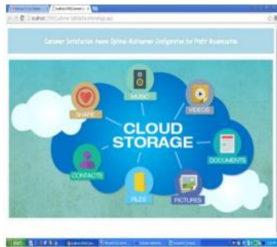
Fig. 1: - Cloud Storage

The maintenance stage focuses on the change that is related with mistake redress, adjustments required as the product condition develops and changes because of the earth advances and changes because of the improvements Brought about by changing client prerequisites. Arrangement must be rolled out for condition improvements, which may influence their PC or different parts of PC based frameworks. Such movement is regularly called upkeep. Upkeep exercises incorporate the improvement of capacities, adjustment of the product to the new handling situations, and remedy of programming bugs. The improvement incorporates giving new practical capacities, enhancing client showcases and methods of fascination, updating execution qualities and the adjustment of programming to the new machine for execution. Issue revision includes adjustment and revalidation of programming to redress mistakes Correction Even with the best Quality affirmation exercises, it is likely that the client will experience surrenders in the product; amend upkeep changes the product to remedy abandons. Adjustment Over time, the first condition for which the product is created is probably going to change. Mobile support brings about adjustment to the product to an oblige changes to it outside condition.