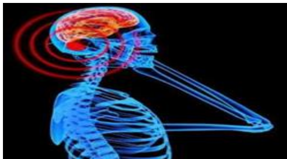
Fig. 2. Radiation effect on brain

The estimations of the SAR for people is defined as the change in the capacity of the recurrence of electromagnetic radiation assuming a particular human body.