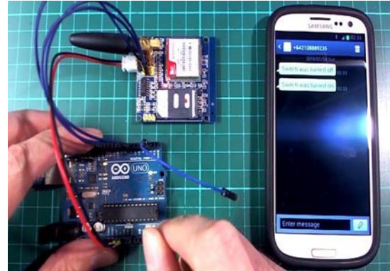
Figure 2 Heart beat monitoring system using GSM

The heart beat sensor senses the heart rate of the patient and transmits the data through the GSM module to the patient's mobile phone or the doctor's phone where the readings are monitored and the health conditions are under control. This system measures the heartbeat of a person and the measured data is send to a mobile as SMS through GSM module. Using this system an analytical data sheet is created by measuring the heart beat rates of various patients. The Figure 2 shows the output of the heart beat monitoring system.