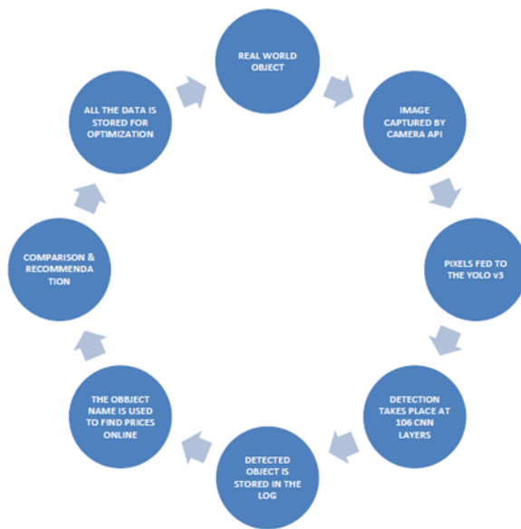
Figure 1.1 - Steps of Object Detection.

As far as the scope of this paper is concerned, we describe the following technologies: