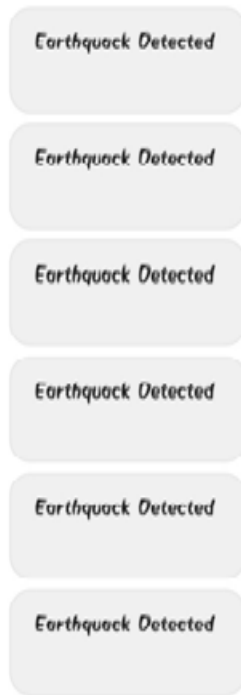
Figure 4.2 Alert Message to the Mobile.