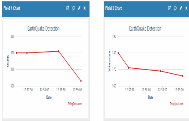
Figure 4.1 Graphical representation of output.

out of smart phones can also get the warning message by the GSM module. The detailed explanation is that the sensors detect the earth shakes and then the alert signal is passed to the nearby base station. From the base station to the authorized numbers the warning signal can be passed to the public.