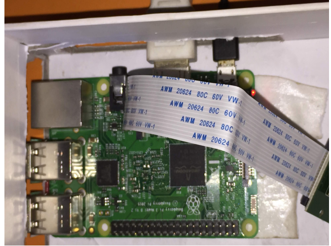
Fig. 4: Environmental set up

Raspberry pi camera can be accessed by installing the raspberry pi camera module cable into the raspberry pi. The cable slots into the connector situated between the ethernet and the HDMI ports, with the silver connectors facing the HDMI port. Run “sudo raspi_config”- Now we can see the camera option. Before starting the process, we have to install raspbian os on raspberry pi. The first step is to download the required software and files. The first software is win32 disk imager, second is SD card formatter and the third software is Raspbian OS. Next step is get an SD card and transfer the raspbian software into the SD card.