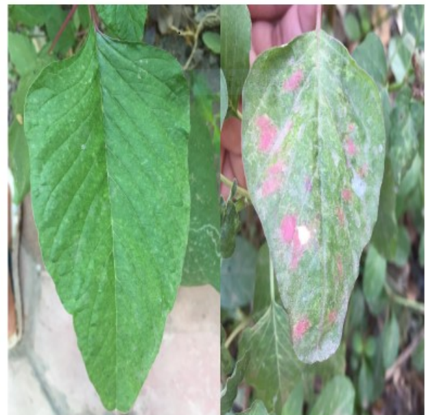
Fig. 1: Healthy and unhealthy spinach leaf

From the advent machine learning techniques, many people have tried and classified plant disease. Kim et al.(2009) have classified the grape fruit peel diseases using color texture features analysis. The texture features are calculated from the spatial gray-level dependence Matrices (SGDM) and the classification is done using squared distance techniques. Grape fruit peel might be infected by several diseases like canker, copper, burn, greasy spot, melanose and wind scar. Helly et al. (2003) developed a new method in which Hue saturation intensity transformation-transformation is applied to the input image, then it is segmented using Fuzzy c-mean algorithm. Feature extraction stage deals with the color, size and shape of the spot and finally classification is done using neural networks.