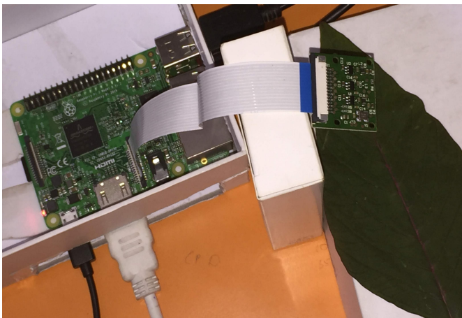
Fig. 5: capturing image using raspberry pi cam