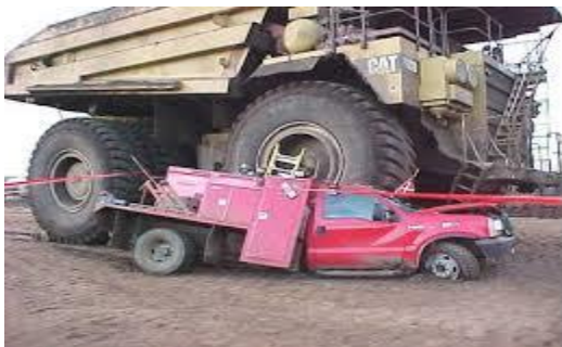
Fig-1 Accident due to Machineries [8]

There are lots of heavy machineries are used in o/c mines such as Shovel, Dragline, Truck, Dumper, Dozer, Scraper etc. it makes mining easy and cheap but cause accident in mines.