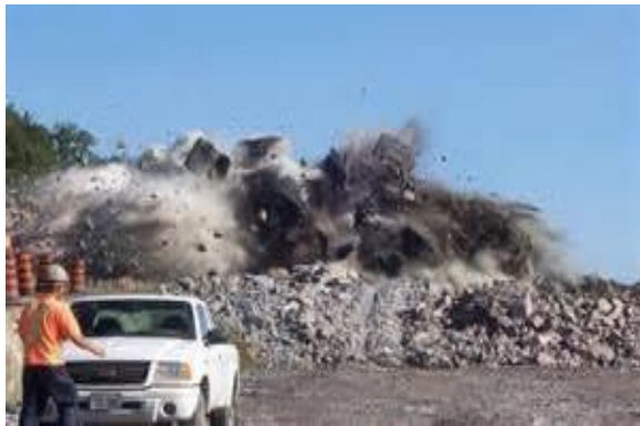
Fig-3 Flyrock [10]

Improper blasting cause Flyrock. Flyrock is a major problem of accident not only the works who work in mines but also people who live in near the mines and present during blasting time in mines.