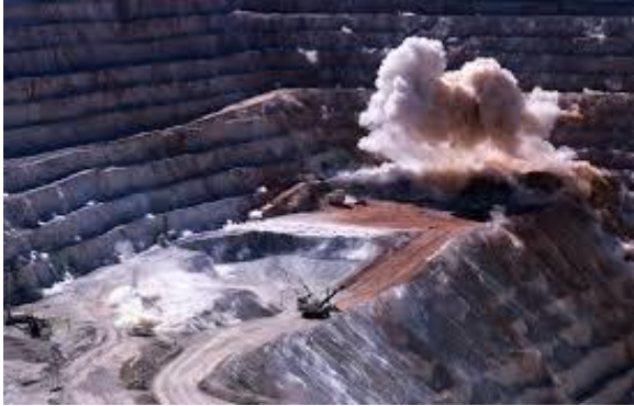
Fig-4 Blasting in O/c mines [12]

Prevention during blasting and handling of explosive.