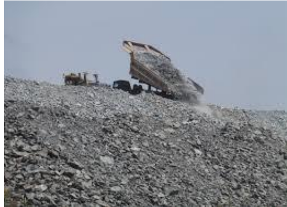
Fig-4 O/B dump [11]

During dumping O/B there are many accident are happened in mines. Lots of death cases are recorded in O/B dump.