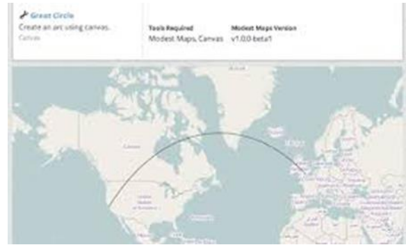
Figure 5 Modest Maps

Modest Maps is a lightweight, simple mapping data visualization tool for web designers.