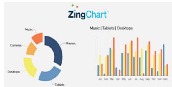
Figure 2 ZingChart

ZingChart is a powerful charting library and they have ability to create charts dashboards and infographics. It is featured with -rich API set that allow user to built interactive Flash or HTML5 charts. It provide hundreds of chart variation and many methods For Example Bar, Scatter, Radar, Piano, Gauge, Sparkline, Mixed, Rank flow and word cloud. Figure 2 shows Zing chart.[22]