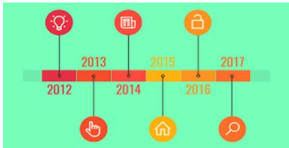
Figure 4 Timeline

Timeline is a different tool which delivers an effective and interactive timeline that responds to the user's mouse, it delivers lot of information in a compressed space.