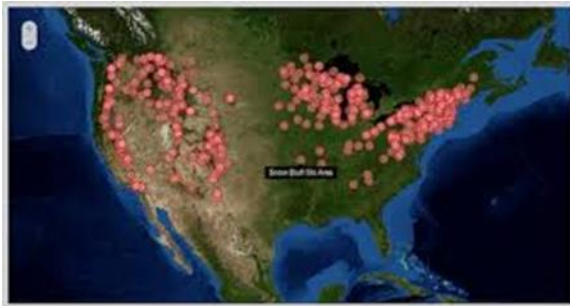
Figure 3 Polymaps

Basic CSS rules are used and its imagery in spherical Mercator tile format. Figure 3 shows the layout of Polymaps. [22]