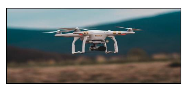
Fig. 2: Pilot less drones s will demand the low latency that 5G promises.