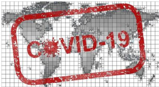
Diagram: - 1.1