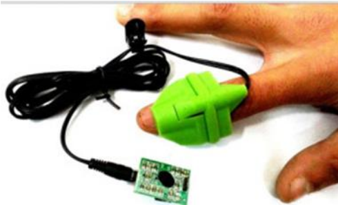
Fig. 2: Heartbeat Sensor

The sensor used in this project is pulse sensor-SEN-11574. Heart rate data can be really useful for determining the health status of a person. The pulse sensor amp'd is a plug and play heart rate sensor for Arduino. It essentially combines a simple optical heart rate sensor with amplification and noise cancellation circuitry making it fast and easy to get reliable pulse readings. It sips power with just 4 mA current draw at 5V. To use it simply clip the pulse sensor to earlobe or fingertip.