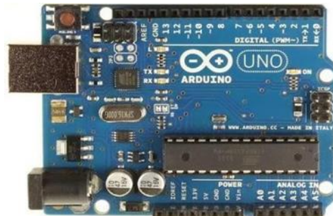
Fig. 1: Arduino Uno

Arduino is an open source, PC paraphernalia and programmed organization, endeavor, and client group that plans and produce microcontroller packs for