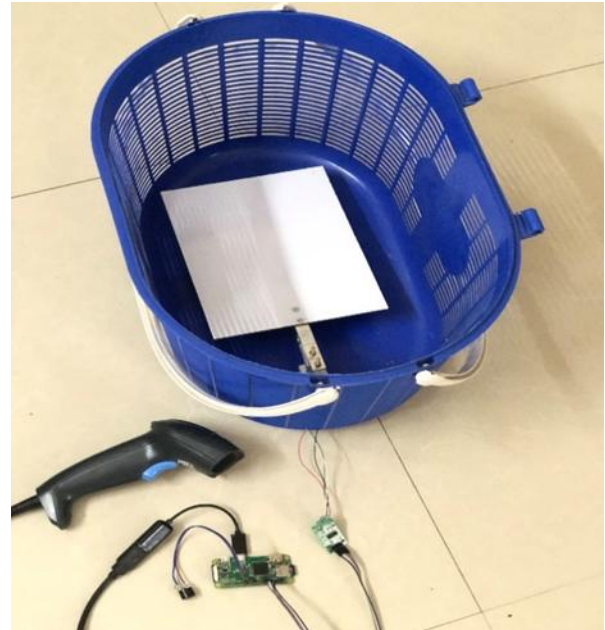
Figure 1. Prototype model

details of the specific scanned product which will display its price, expiry date, product ID and weight.