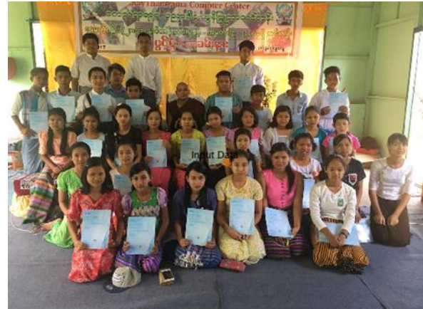
Fig.1 The original input image (file size = 2500 KB)

or compressed image has achieved 66.64% in reduction.