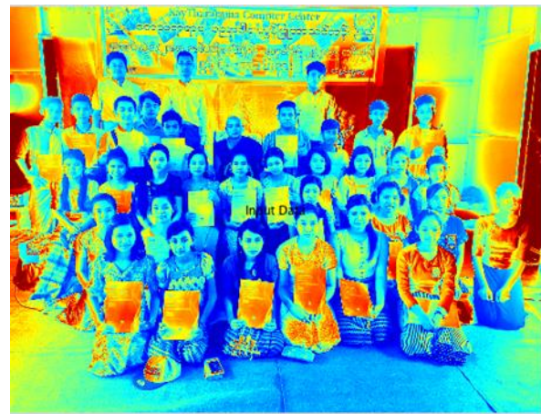
Fig. 2 The dimension-reduced or compressed image using PCA (file size = 1666 KB)