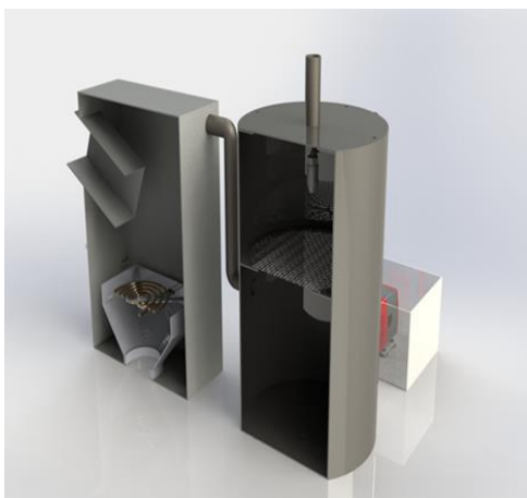
Fig 4.Domestic waste incinerator

Quantity of around 1 kg of waste put into the device through the inlet. Commencement of combustion takes place. The waste material is heated and burned with a heating filament. This heating filament is coiled between a ceramic cast, to avoid any kind of contact within itself. As the coil turns red hot and goes upto a temperature of 800°C to 900°C, it is to be contained in container. Flue gases generated due to burning will find its way out through the exhaust pipe. After being fully burnt these waste material will turn into very light-weighted residue of ash which is conveyed out of the system no type of clogging or blockage causes. In the end, the bottom of this device have an outlet pipe, removing the ash particles from the device. Outlet pipe is further connected to the sewage line, which makes sure that this residue is not causing any type of contact, thus creating a cleanser surrounding. Section model of domestic waste incinerator is as shown in figure no. 4.