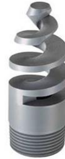
Fig 2.Spray nozzle

A nozzle is a device designed to control the direction or characteristics of a fluid flow (especially to increase velocity) which it exits (or enters) an enclosed chamber or pipe as shown in figure no. 2. A nozzle is often a pipe or tube of varying cross sectional area, and it can be used to direct or modify the flow of a fluid (liquid or gas).