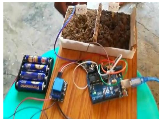
Figure 3: Serial monitor

The Arduino UNO R3 microcontroller is configured for automated plant watering to give interruption signals via the driver board. Application: The ground sensor is installed on the A0 pin of the Arduino module, which measures humidity of the soil. As soil moisture levels decrease, the sensor detects the moisture change, sending the microcontroller a signal such that it is possible to turn on the pump (motor). This word may be used for the automatic machine watering process. The circuit is composed of the Arduino UNO board, a moisture sensor for the dirt, a 6V engine generator, an L293D engine driver (IC1), an IC motor generator. The Arduino frame can be powered by a 5V to 9V wall wart, plug-in adaptor or solar panel. A separate 6V to 10V battery is needed for the pump motor.