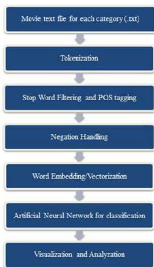
Fig.2. Flow diagram for movie genre prediction