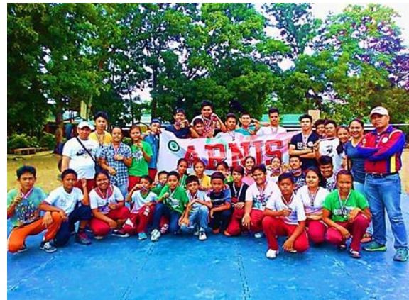
Figure 4. Naga National High School Arnis Team