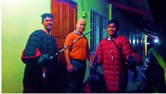
Figure 1. WEKAF protective equipment typically consists of a set of head and body protectors, arm guards, and hand gloves capable of withstanding hits from live sticks during sparring.

Arnis Philippines (ARPI) system was established in 1986. And most prominently used during the 2005 Southeast Asian Games. In this system, participants fight with a lightly padded stick that tends to flex on hard impact. Headgears can be used for protection, and hitting in the back of the head is strictly prohibited as the headgear is open from behind. The fights are observed by judges stationed at various positions to follow if the matches are going fair. The loudness of the impact determines the strike strength. Thrusts to the body help to gain points but are harder to perform. Punches, kicks, and throws are prohibited, along with sticks' direct hit on the face. Disarms must be performed clearly and quickly. The Arnis Pederasyong Internasyonal, Inc. (i-ARNIS) Rules and Regulations of Competitive Arnis are currently used in the conduct of all Arnis competitions at the local, national, and international levels. Arnis Philippines, Inc. developed the Rules and Regulations of Competitive Arnis after extensive consultations with numerous Arnis martial arts authorities. The rules have been carefully crafted to ensure that they conform to and approximate the actual Arnis martial arts in Full Contact and Anyo events while prioritizing the athlete's safety as recognized by the Department of Education.