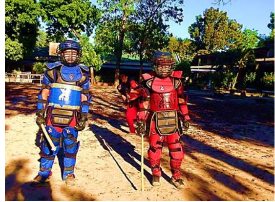
Figure 2. Red and Blue protective equipment consists of the head and body protectors, upper and lower arm guards, leg and shin guards, groin guards, and gloves intended for padded stick blows.

Arnis Philippines (ARPI) system was established in 1986. And most prominently used during the 2005 Southeast Asian Games. In this system, participants fight with a lightly padded stick that tends to flex on hard impact. Headgears can be used for protection, and hitting in the back of the head is strictly prohibited as the headgear is open from behind. The fights are observed by judges stationed at various positions to follow if the matches are going fair. The loudness of the impact determines the strike strength. Thrusts to the body help to gain points but are harder to perform. Punches, kicks, and throws are prohibited, along with sticks' direct hit on the face. Disarms must be performed clearly and quickly. The Arnis Pederasyong Internasyonal, Inc. (i-ARNIS) Rules and Regulations of Competitive Arnis are currently used in the conduct of all Arnis competitions at the local, national, and international levels. Arnis Philippines, Inc. developed the Rules and Regulations of Competitive Arnis after extensive consultations with numerous Arnis martial arts authorities. The rules have been carefully crafted to ensure that they conform to and approximate the actual Arnis martial arts in Full Contact and Anyo events while prioritizing the athlete's safety as recognized by the Department of Education.