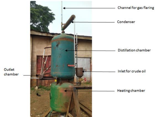
Fig. 4: Modular refinery