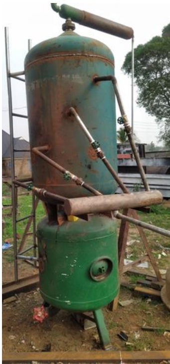
Fig. 3: Fabricated modular refinery