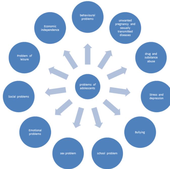
Figure 1: problems of adolescents