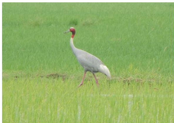
Fig. 2. Sarus Crane around Alwara Lake

Indian Sarus Crane, Grus antigone antigone (Linnaeus, 1758) is the largest and only resident breeding crane of Indian sub-continent (Ali and Repley, 1980) found in several parts of India (Vyasa, 2002). The sarus crane (Fig. 2) pairs are well known for their faithfulness and living togetherness and popular as eternal symbol of unconditional love, devotion and good fortune with high degree of marital fidelity as they pair for lifelong (Prakash and Verma, 2016a; Ashok, 2016; Verma, 2018a). The sarus crane is now 'State Bird of Uttar Pradesh' and shows strong positive correlation with agriculture (Verma, 2018b).