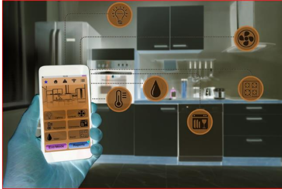
Figure 1: Smart kitchen using a smartphone

An app that is compatible with your smart kitchen appliances must be installed. With the help of the app, we can access our home appliances as per our needs from short as well as very long distances. Figure 1 reveals the various appliances controlled by an app or smartphone [8-12].