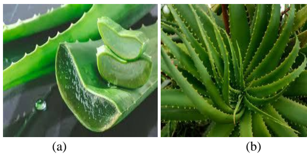
Fig 2. (a) Incised plant showing latex, (b) aloe vera plant