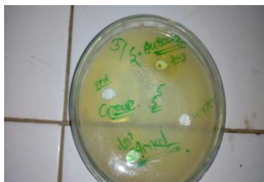
Fig 3. Antimicrobial activity. (Staphylococcus aureus)

The antimicrobial activity of fresh gel of aloe vera and the creams formulated with these extract were evaluated. The preliminary in vitro antimicrobial activity of the extract at various concentration and those of their creams were determined against some microorganisms using the agar cup plate method. The minimum inhibitory concentration (MIC) was also determined by agar dilution method. The physical properties of creams formulated with these extract was evaluated using standard procedures.