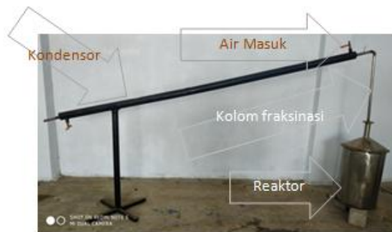
Figure 2. Pyrolysis Equipment