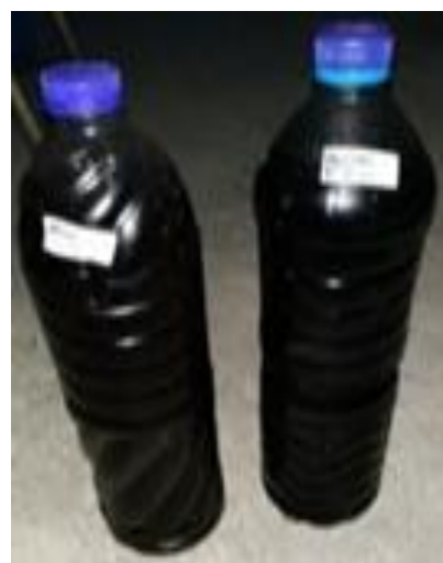
Figure 1. The raw material is oil from LDPE plastic waste before being refined

The main ingredient in this research is oil from LDPE plastic waste.